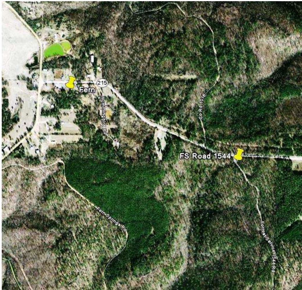
(Prepared by Joe Neal November 2010)